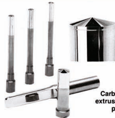
Carbide draw dies and punches

Carbide draw dies and punches along with extrusion pins are nothing new to Dura-Carb personnel. Beginning with the proper carbide grade selection, precision grinding and more importantly...finishes, we feel our products will outlast any other on the market today.